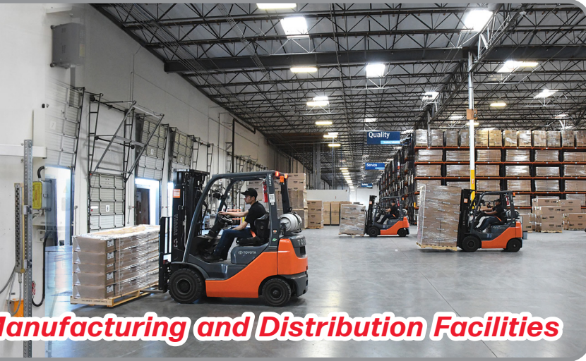
Manufacturing and Distribution Facilities

successful recycling program that ensures the proper reuse and steel, powder paint and corrugated materials.